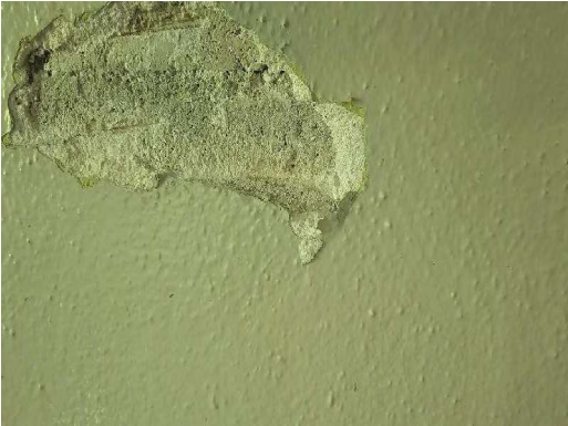
1656-3 Plaster/Rough Coat Typical Interior Walls