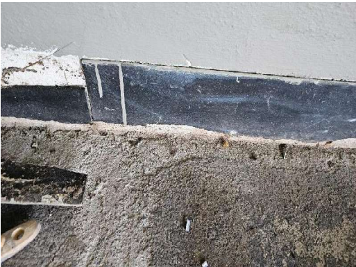
1656-5 Cove Base/Black (6% Chrysotile) Mastic/Black (4% Chrysotile) Interior Living Room/Bedroom (Appx 60 lin ft)