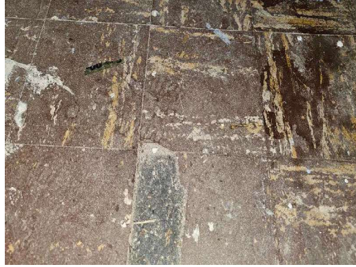
1656-2 9"x9" Floor Tile/Brown (4% Chrysotile) Mastic Interior Bedroom (Appx 250 sq ft)