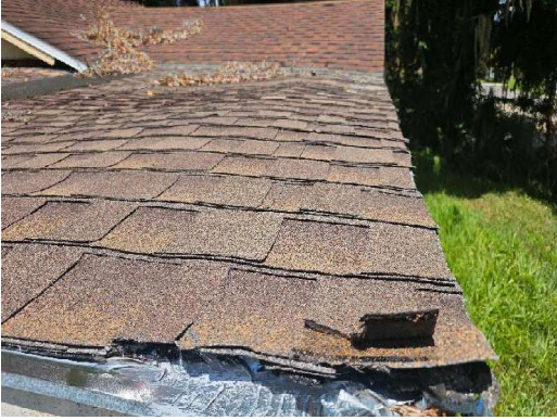
1656-1 Asphalt Shingle/Tar Typical Exterior Roof