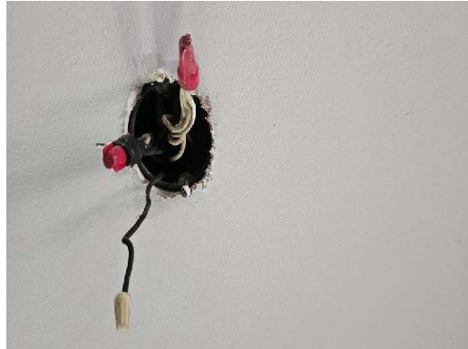
1656-4 Drywall Typical Interior Ceilings